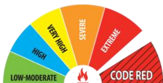
Victoria's old system

Victoria's fire danger rating system will change from six levels to four. All signs in Victoria will be replaced with new signs. The current fire danger rating system is based on science that is more than 60 years old. The AFDRS uses the latest science about weather, vegetation and how fire behaves in different landscapes to improve fire danger forecasts. This means emergency services will be better prepared, make improved decisions, and provide better advice to the community.